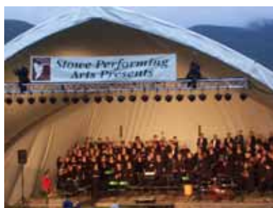
GCG (center) performs during the mass choir concert