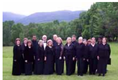
GCG prepares for concert at the Trapp Family Lodge Concert Meadow, Stowe, VT